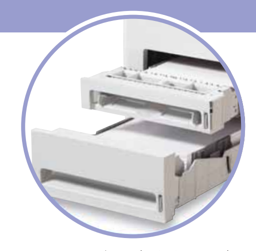
Boost paper capacity on the SP C221N and SP C222DN to 751 sheets with the optional 500-Sheet Paper Feed Unit.