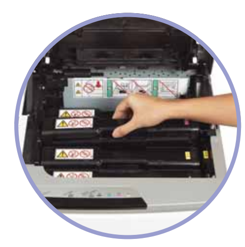
All-in-One Cartridges and a top-loading design make it easy to replace supplies.